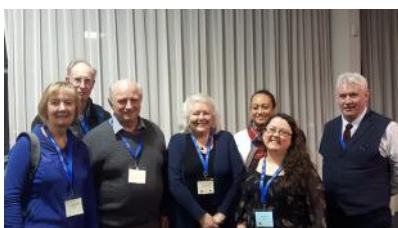
Foundation staff reuniting with old friends in Auckland, New Zealand who had attended our events in Belfast