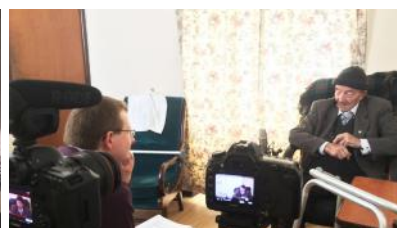
Recording for posterity the memories of a 96-year-old man in County Antrim

Since it was established in 1956, the Ulster Historical Foundation has carved a unique space in the world of genealogy. We are the only body on the island of Ireland which provides both expertise in family history research and produces a range of high-quality publications.