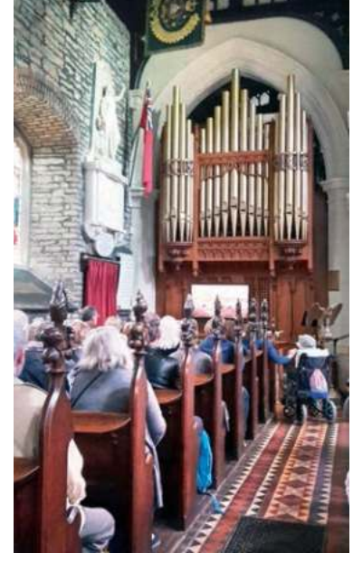
St Columb's Cathedral, Derry